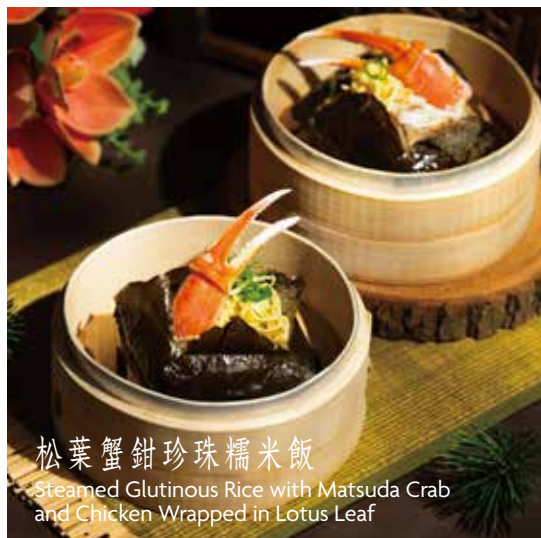
松葉蟹鉗珍珠糯米飯 Steamed Glutinous Rice with Matsuda Crab and Chicken Wrapped in Lotus Leaf