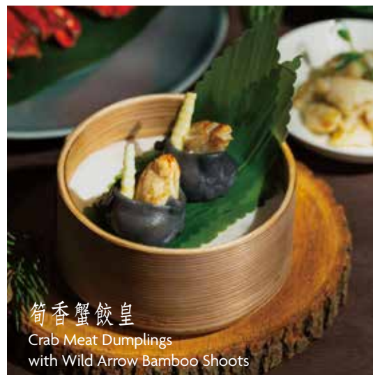
筍香蟹餃皇 Crab Meat Dumplings with Wild Arrow Bamboo Shoots