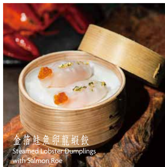
金箔鮭魚卵龍蝦餃 Steamed Lobster Dumplings with Salmon Roe