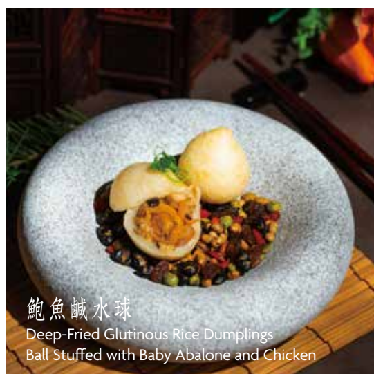
鮑魚鹹水球 Deep-Fried Glutinous Rice Dumplings Ball Stuffed with Baby Abalone and Chicken